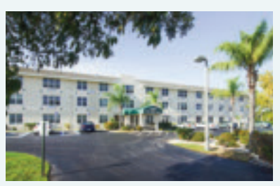
Palm Harbor Apts. North Fort Myers, Florida, 82 apts. Undergoing $5.4 million