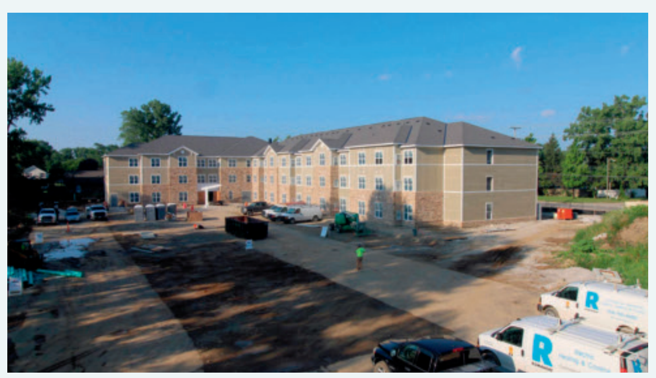
Bretton Woods construction update, July 2022