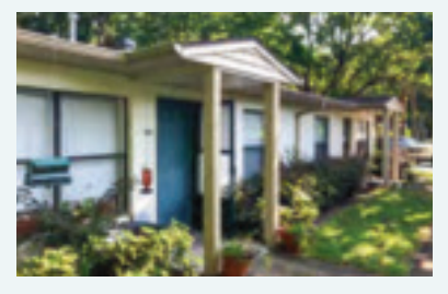
Cedar Oaks Apts. Holly Hill, Florida, 44 apartments Undergoing $2.6 million renovation

Carnegie Towers Cleveland, Ohio, 171 apartments Completed $12.7 million renovation in January 2022