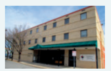
Lennox House Grand Prairie, Texas, 40 apts. Completed $3.3 million renovation