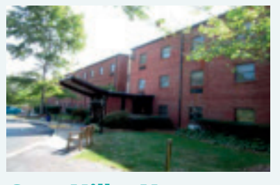
Gene Miller Manor Union City, Georgia, 76 apts. Undergoing $5.6 million

Sebring, Florida, 81 apartments Undergoing $5.3 million renovation